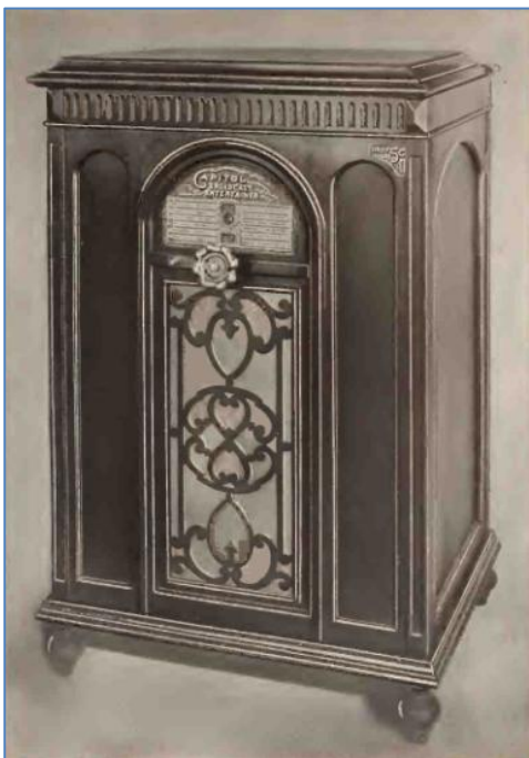
12 sel. Capitol "Broadcast Entertainer" introduced 1928